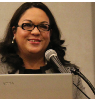
Luz Escamilla Utah State Senator

Keynote speaker and Utah State Senator Luz Escamilla spoke about her successful efforts as a legislator in spearheading the passage of a bill recognizing commercial interior design as a licensed profession in Utah.